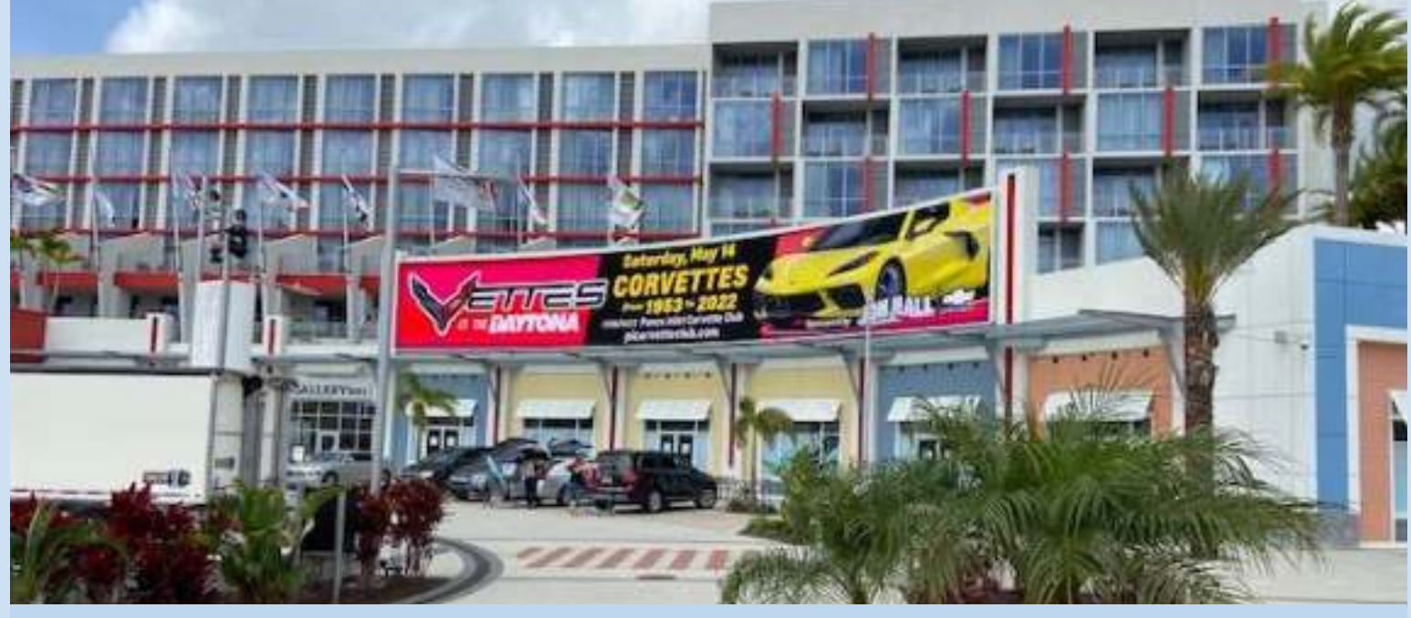
"Vettes at One Daytona" ...

We had a great turn-out at our March meeting. The report on our May 13<sup>th</sup> Car Show "Vettes at One Daytona" indicates that the event is on schedule as planned. Committee Chairman and club officers have now met twice at the Half Wall in