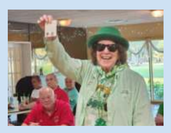
2023 VENICE FLORIDA CAR SHOW