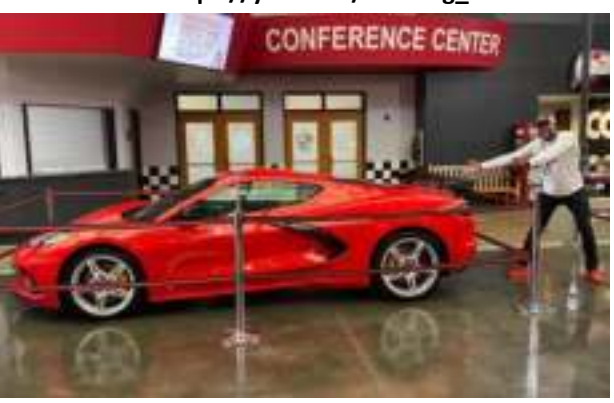
VIDEO LINK: https://youtu.be/oY2WYg_I1TY

Currently, this delivery experience is offered for the C8 Corvette. Prospective buyers have the choice between two C8 flavors, the C8 Stingray and the C8 Z06. The 2023 Stingray is powered by the 6.2L V8 LT2, rated at 490 horsepower and 465 pound-feet of torque, while the 2023 Corvette Z06 is powered