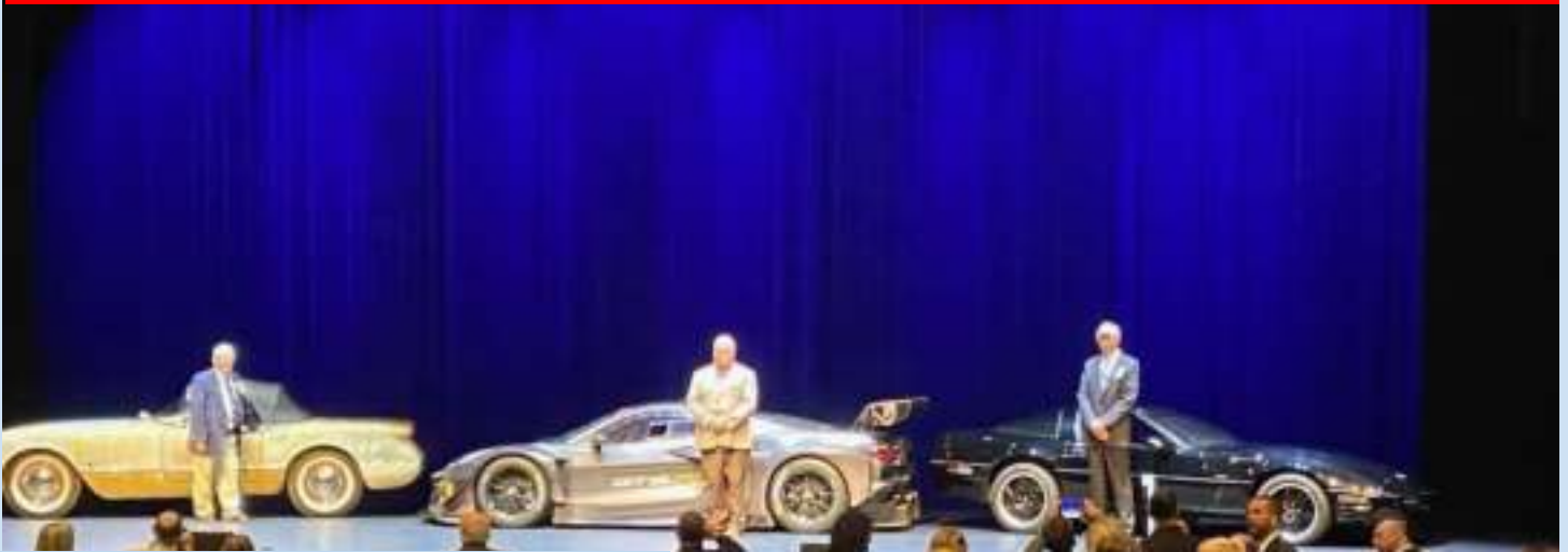
2023 Corvette Museum Hall of Fame Inductees