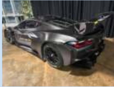
New Corvette Racing GT3 R Model for 2024