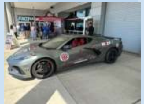
Mobil One Display at Bolling Green